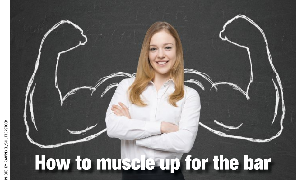
Heavy lifting during law school is the best way to train for the grueling exam.