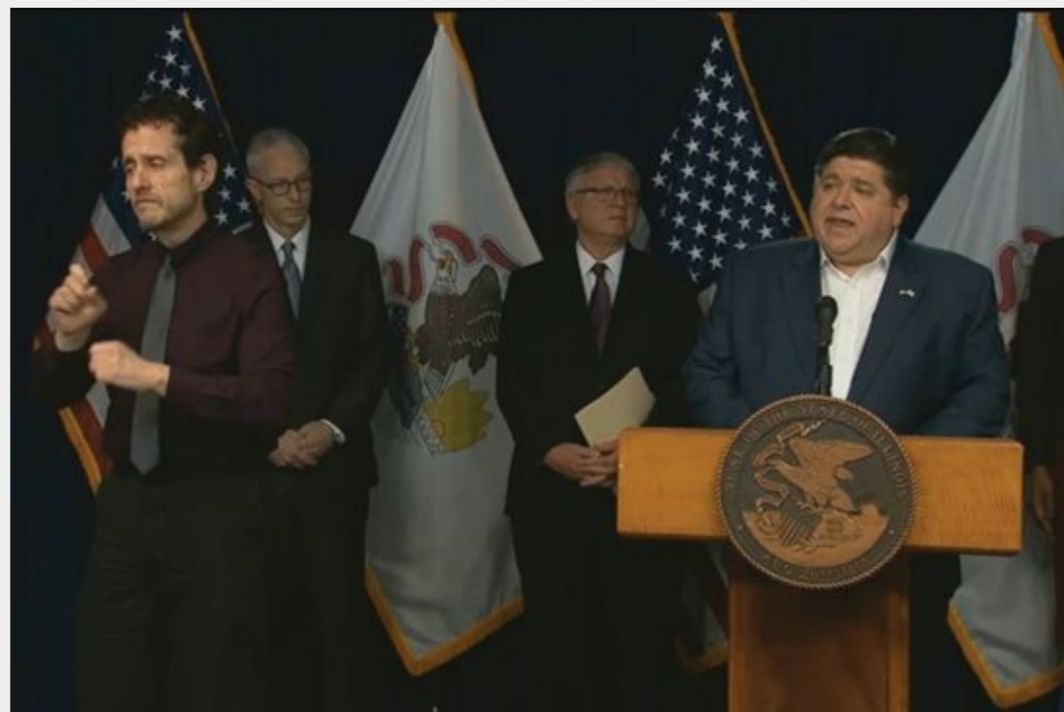
MAR 31 TUE Pritzker to stretch stay-at-home order