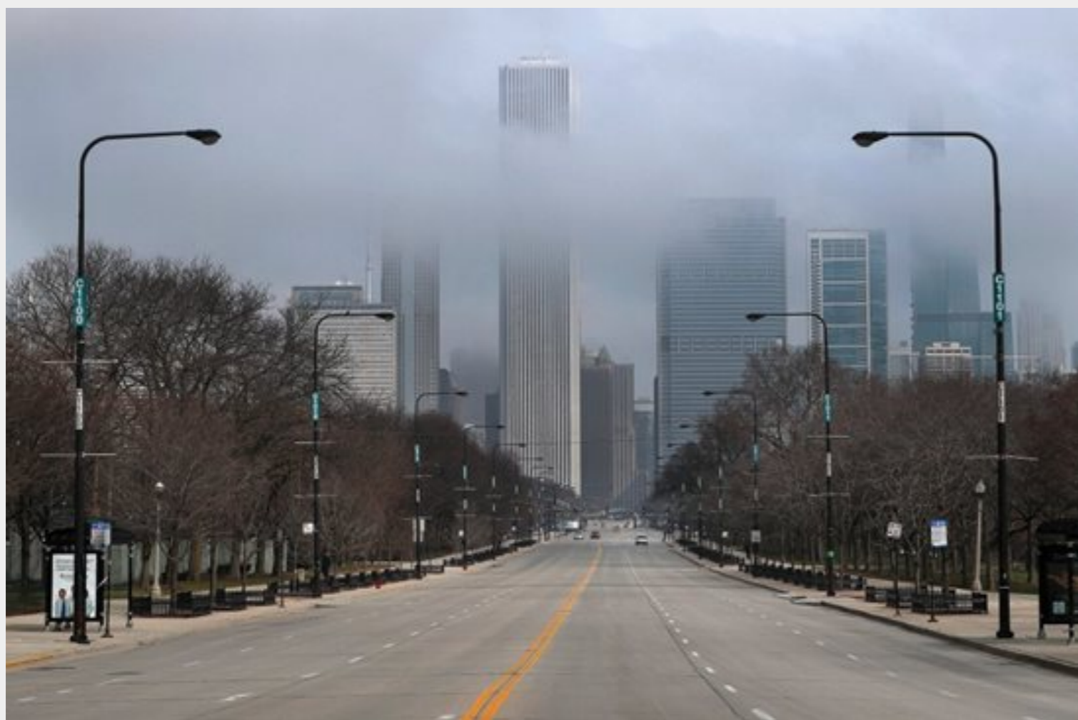
MAR 25 WED Illinois could need 38K more beds if virus isn't contained