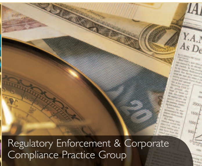
Regulatory Enforcement & Corporate Compliance Practice Group

Law Practice Group, is a multidisciplinary group of attorneys who combine their skills and experience to enable our clients to embrace the rapidly changing American economic environment. Our team includes lawyers who have experience in the development of public policy, and the legal skills necessary to guide our clients through the flurry of new federal and state economic recovery laws. The areas affected by these laws include real estate, environmental, construction, health care, intellectual property, public law, public finance, bankruptcy and general corporate.