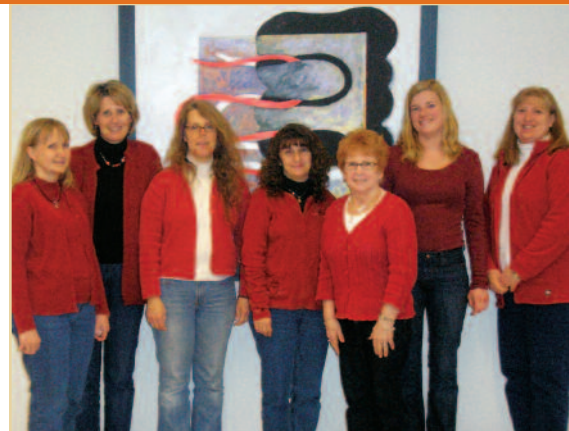
Staff members in Benesch's Columbus office wear red in support of the American Heart Association.

The “Go Red” campaign was founded to help women fight back against heart disease, which is the number one killer of women in America. The campaign aims to continue to educate women about their risks and help them find their own personal path to better health for life. ►