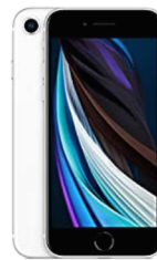
Apple iPhone SE (2nd Generation), US Version, 64... $170.00 $189.00