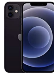
Apple iPhone 12, 64GB, Black - Fully Unlocked (Renewed) $484.80