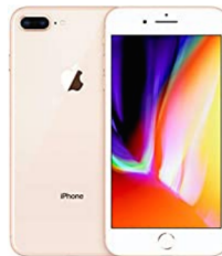
Apple iPhone 8 Plus, US Version, 64GB, $213.00 Gold - M...