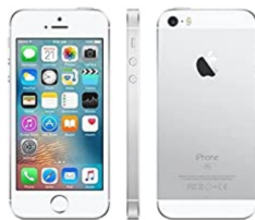
iPhone SE 16GB Unlocked, Silver $105.59 (Gen 1)