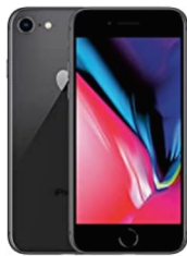
Apple iPhone 8, US Version, 64GB, $142.00 Space Gray - Unl...