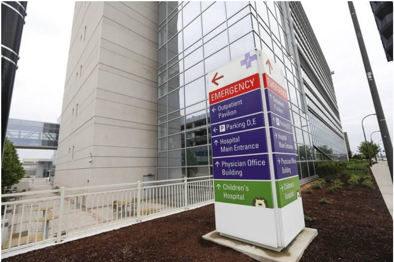
Advocate Christ Medical Center in Oak Lawn on May 21, 2019.