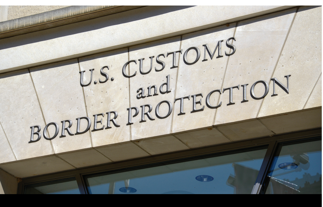
U.S. Customs Protest Primer