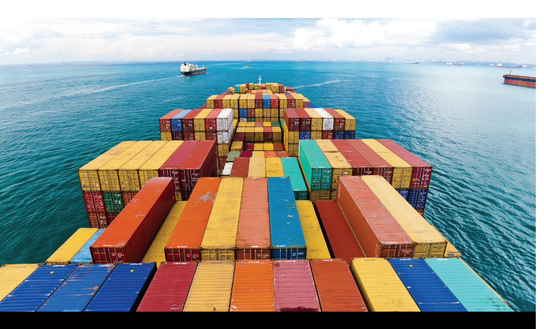
FMC Dispute Resolution: A Guide for Using CADRS to Resolve Ocean Carriage Disputes