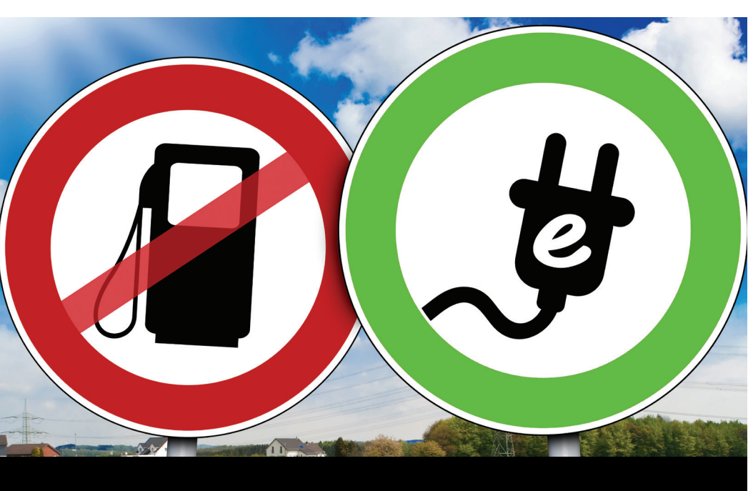
State Legislatures Confront California Vehicle Emissions Regulations