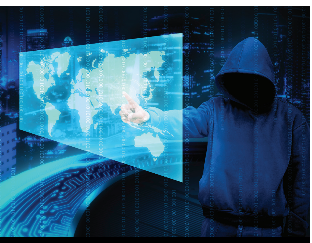
Cybersecurity Threats Trigger Industry-Wide Call to Action for Transportation and Logistics Providers