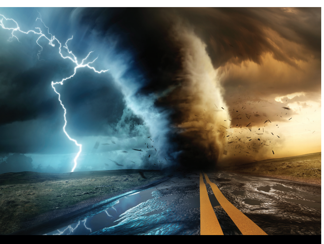
An Act of God Carve-Out Survives in Cargo Litigation, in the High-Tech Era