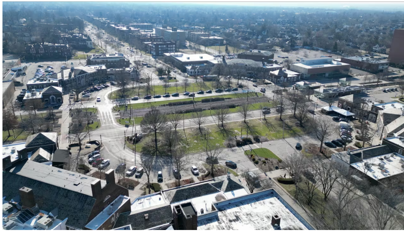
Aerial view of Cleveland's Shaker Square shopping district.

In contrast to an earlier round of planning in 2018-2019 that emphasized redesigning the square's public spaces, the new project will focus on getting the retail and commercial basics right before figuring out what to do with the outdoor spaces.