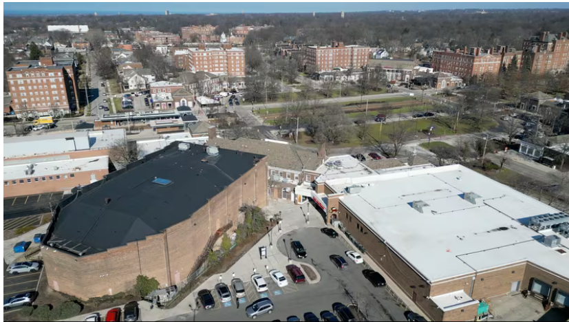
An aerial view of Cleveland's Shaker Square shopping district in late January, 2024 shows off new roofs installed as part of a revitalization effort.

The work so far has included replacing flat roofs that account for 85% of the total roof area at the square and replacing 60 of the 120 rooftop heating, ventilating and cooling units. Contractors have replaced some of the square's rotting woodwork and will continue that work this spring and summer. They've fixed a nasty sewage backup, doubled the intensity of street lighting, and repaved the square's two large parking lots.