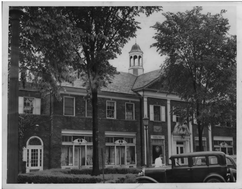
Shaker Square in 1937.