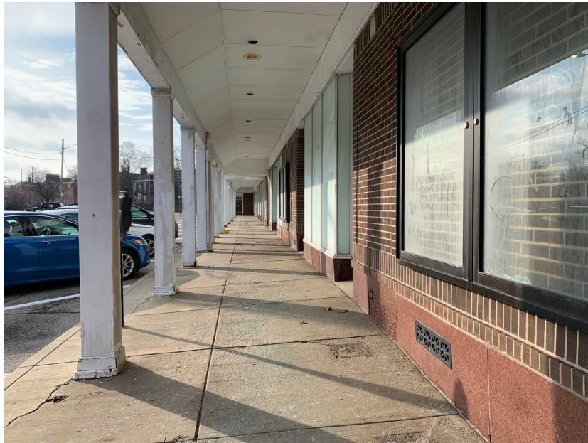
An arcade fronts the vacant former "Bonwit Teller" shopping strip along Van Aken Boulevard southeast of Shaker Square's southeast quadrant in Cleveland. The shopping strip, which has been an eyesore, is to be demolished later this year.