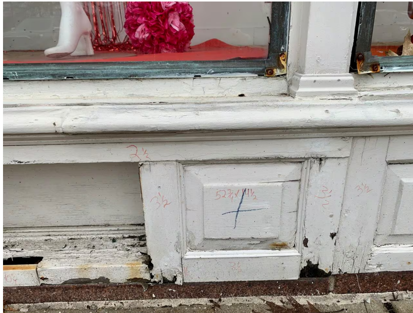
Contractors have indicated with pencil markings the location of woodwork at Shaker Square to be replaced in the spring or summer of 2024.