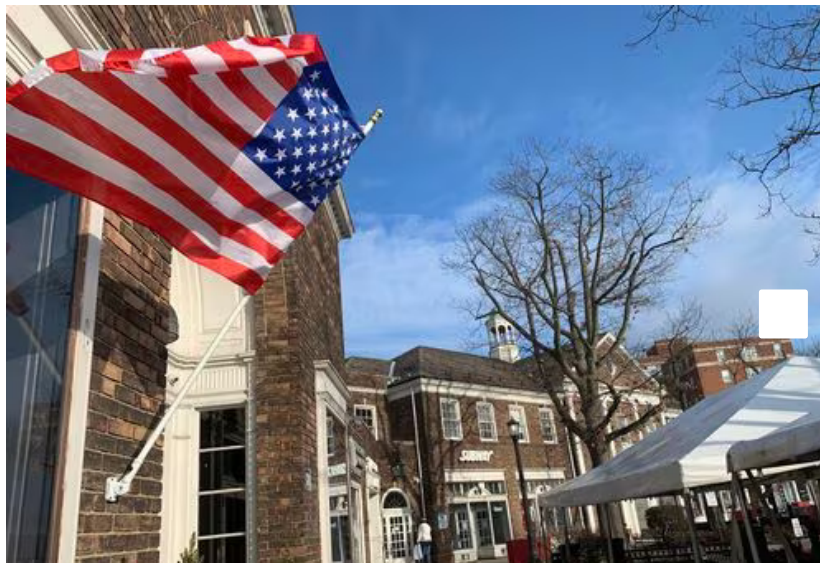
Old Glory flies over the doorway to EDWINS in Shaker Square, the fine-dining dining flagship of the organization's Leadership & Restaurant Institute, which trains formerly incarcerated adults to work in hospitality.

Updated: Feb. 16, 2024, 5:20 a.m. | Published: Feb. 16, 2024, 5:00 a.m.