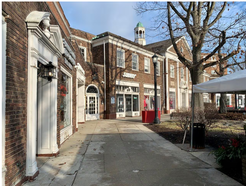
January sunlight highlights the neo-Georgian architecture of Shaker Square in Cleveland.

But the square's immediate past owner, Cleveland-based Coral Co., struggled under an $11 million mortgage as the property gradually declined. It also faced competition from newer food, retail, housing and/or office developments that emerged further east in Cuyahoga County, including the Van Aken District in Shaker Heights, Legacy Village in Lyndhurst, and Pinecrest in Orange.