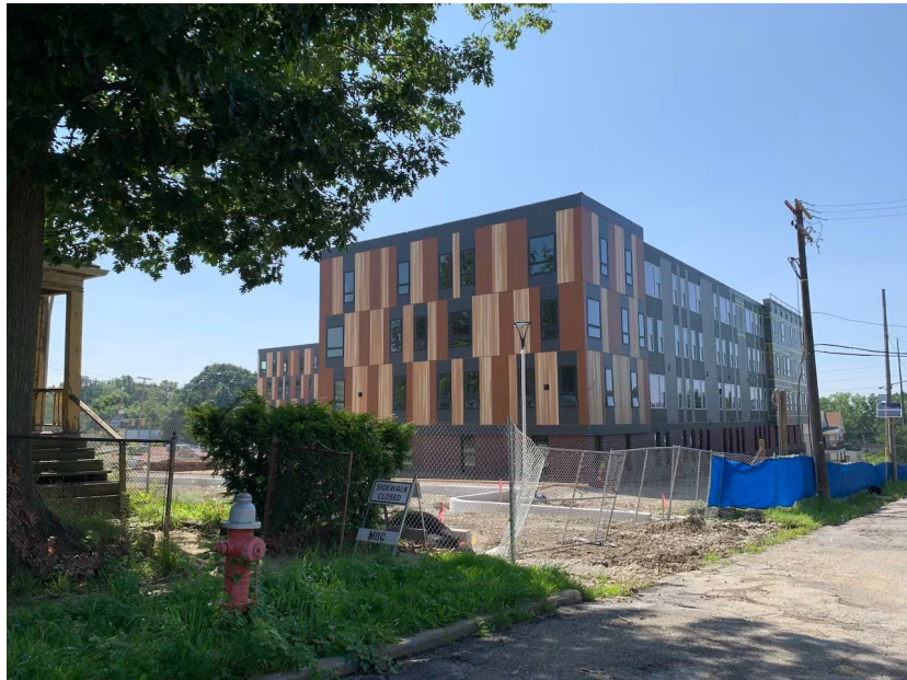
The Cuyahoga Metropolitan Housing Authority is nearing completion of the first of six phases of construction in its $281 million Woodhill Choice project, aimed at improving housing options on Cleveland's East Side.

Last year, City Council approved Cleveland Mayor Justin Bibb's plan to invest $15 million in federal aid from the American Rescue Plan Act to jumpstart additional private investment in the Mt. Pleasant, Union-Miles and Lee-Harvard neighborhoods south and southeast of Shaker Square.